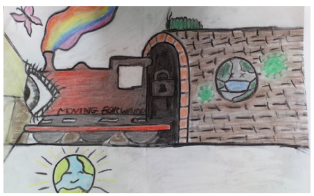
Shealeigh Clarke 'Moving forwards'