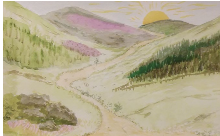
Denise Dell 'Looking forwards to a clearer dawn'