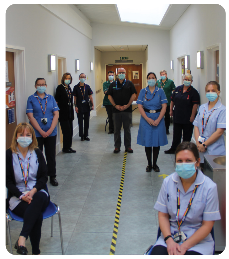
Colleagues at our vaccination hub

The meeting began by showcasing two developments: the Derbyshire Mental Health Helpline and Support Service (see page 10), which was established in response to the pandemic and is now a permanent freephone service available to everyone living in Derbyshire; and the Trust's COVID-19 vaccination hub, which vaccinates Trust staff and patients (see page 10).