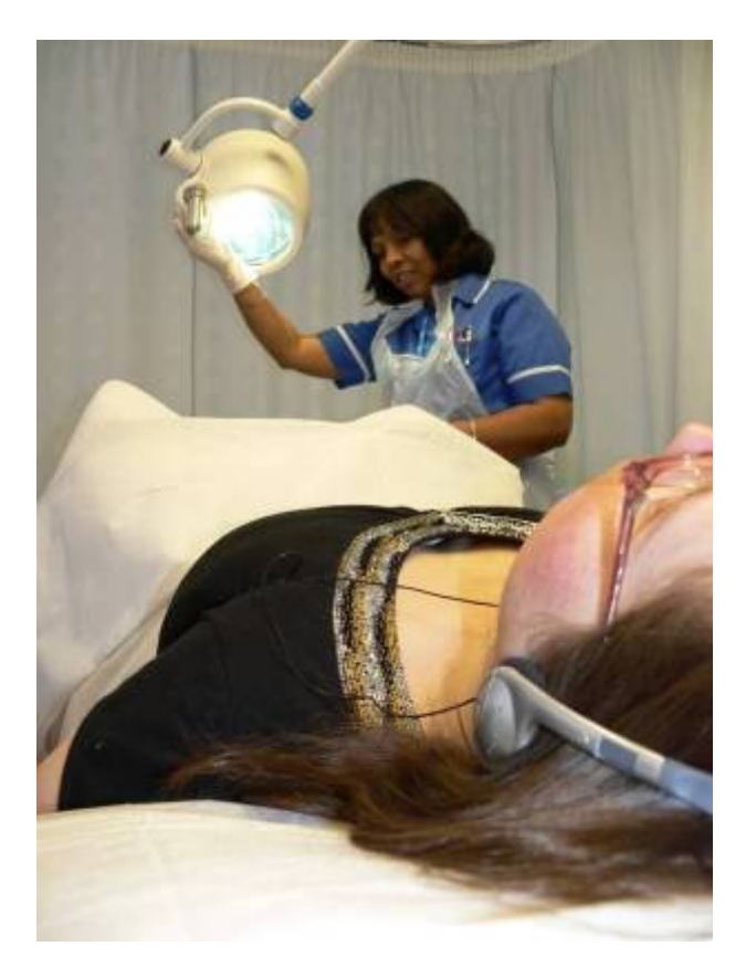
The doctor or nurse will use a light to help her see better.